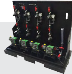
DOSING SKID SYSTEM